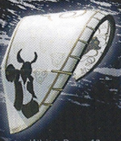
White Boss 12