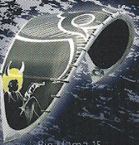
Big Mama 15