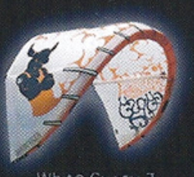
White Gypsy 7